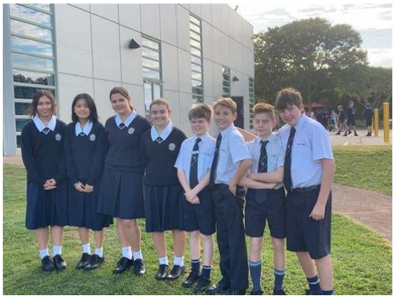
Year 7 Da Vinci Team