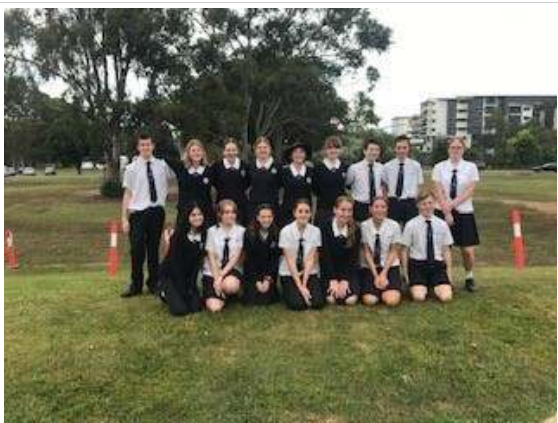
Year 9&10 Da Vinci Team

Congratulations to our four Da Vinci Teams, who competed at the State Finals this week. All teams should be very proud of their efforts, the students walked out of the all-day challenge very positive about the experience.