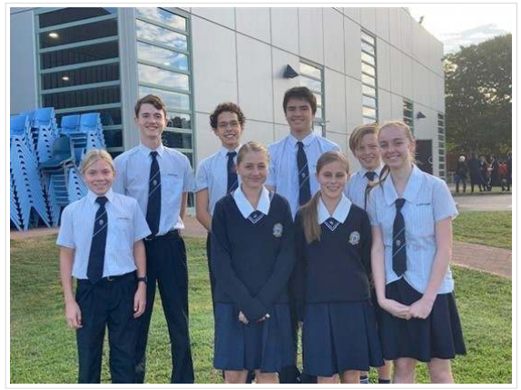
Yr8 Da Vinci Team

The da Vinci Decathlon is an academic competition designed to challenge and stimulate the minds of school students. Students compete in teams of eight across 10 disciplines: engineering, mathematics and chess, code breaking, art and poetry, science, English, ideation, creative producers, cartography, and legacy.