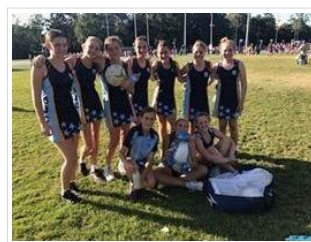
QC Cup Juniors