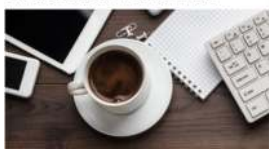
The Good Oil 2021 Writers' Award