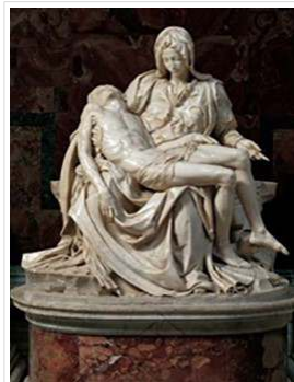
Pietà – Michelangelo