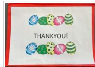
Thank you card from the residents.

The cards were very well received, the residents just loved them.