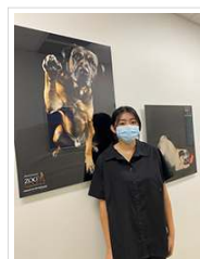
Kunica at Greencross Vets Kawana